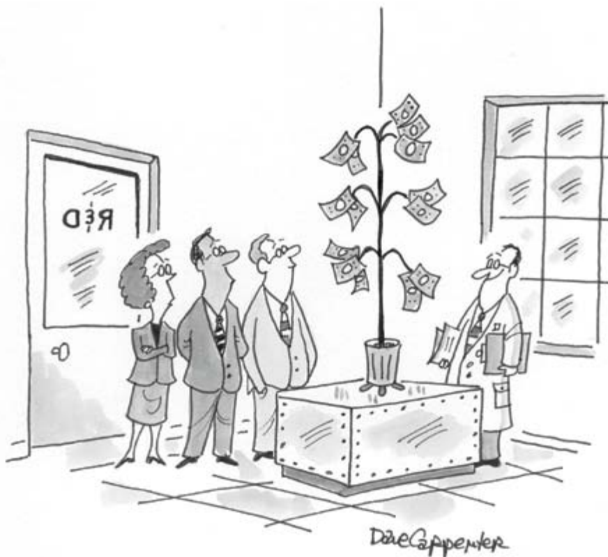
“We’re still hammering out the details with the Treasury Department.”